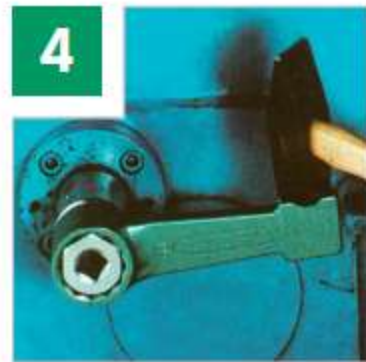
4 STAHLWILLE No 8 striking face double hex box-spanners are tougher, thinner and higher.