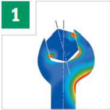
1 Load zones in standard-quality spanners