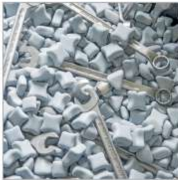
Snug-fitting, skin-friendly surfaces thanks to STAHLWILLE's rounded finish