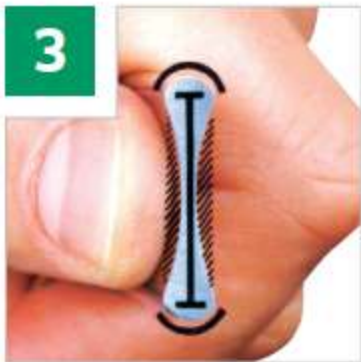
3 Resistant to bending thanks to the double-T profile